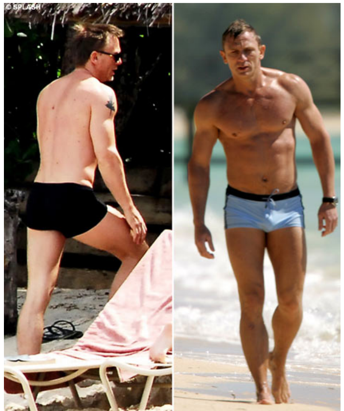
Action replay: Craig reprises his now iconic scene in Casino Royale where he wandered down a Caribbean beach in a pair of tight swimming trunks